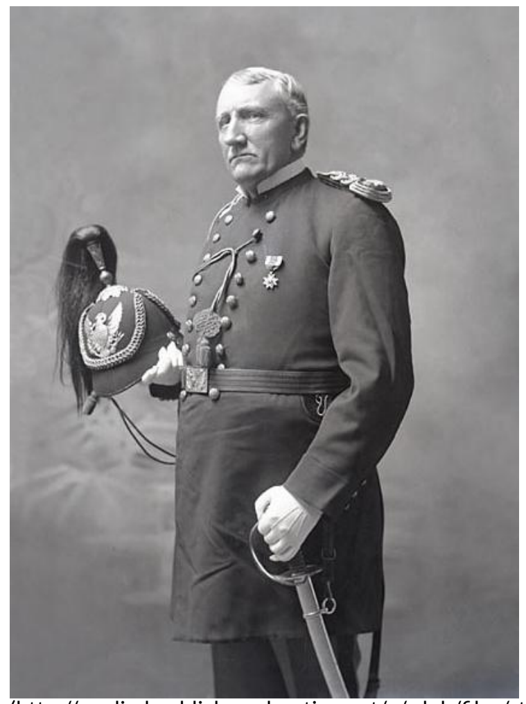
U.S. Army Captain Henry Pratt founded the Carlisle Indian