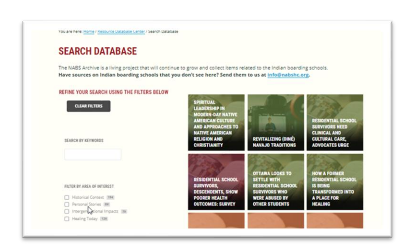
Screenshot of NABS's online database of boarding school records and information

A grant through the National Endowment for the Humanities (NEH) supports NABS's efforts to build a national digital archive of resources related to Native American boarding schools. NABS currently manages an online database of resources. So far, under this program, NABS has added an additional 300+ resources to an online database of boarding school information. NABS has also established a Research Advisory Council to support best practices and the discovery of information.