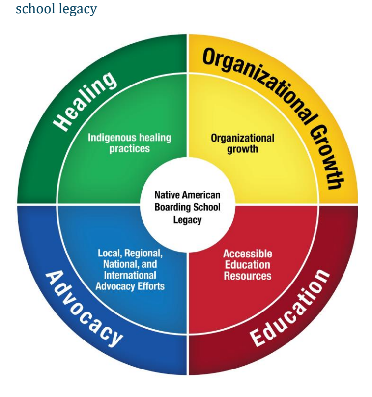
Figure 2. NABS conceptual framework for boarding school legacy

Over the past 7 years, NABS has been unwavering in these concepts. The